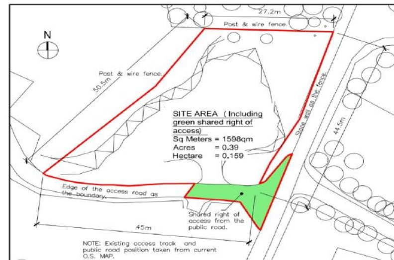
SITE BOUNDARY PLAN - 1:500

Mains water and electricity are on site. Drainage will be by way of septic tank. It is the responsibility of the purchaser to check that all services will be granted and satisfy for themselves that they meet their own personal requirements.